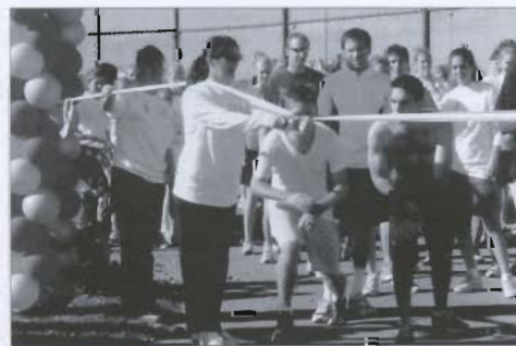
Spielman Walk for OSU Homecoming And they're off!